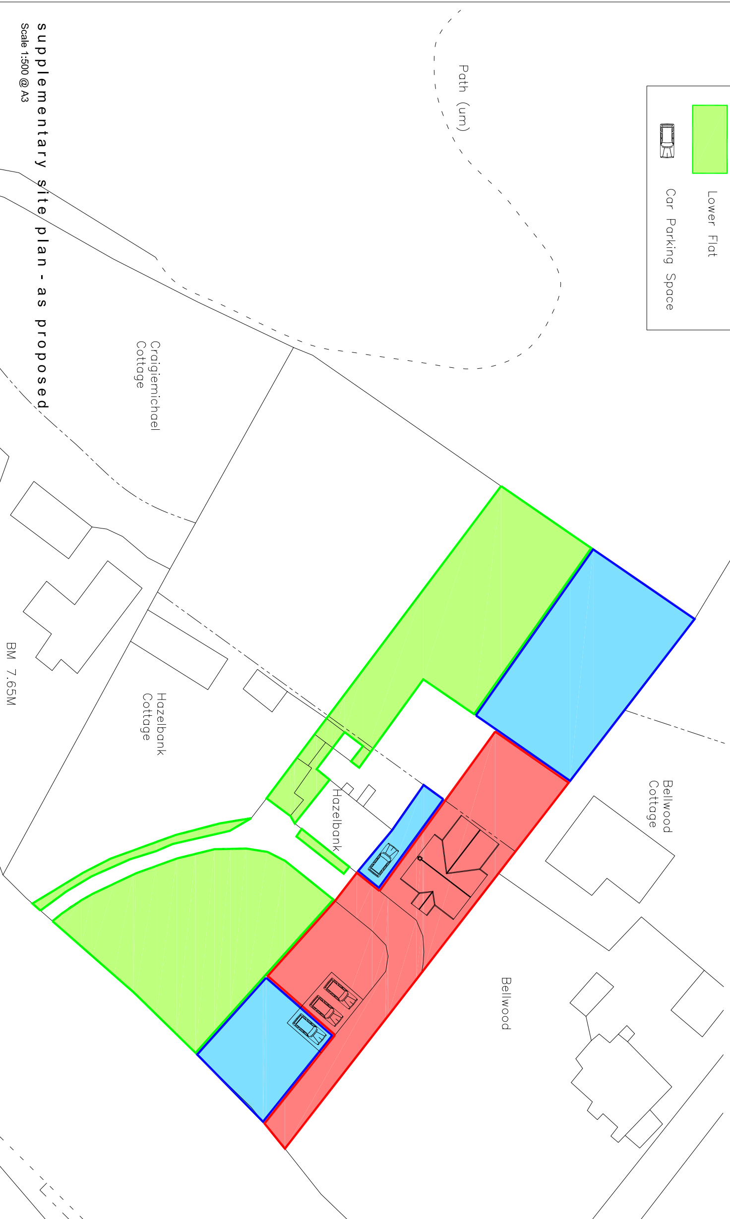
supplementary site plan - as proposed Scale 1:500 @ A3

31.07.12 Red Line Altered, Window Positions Added A KM Car Parking Altered